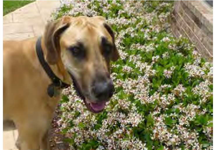
Photo: Duke, a Great Dane and Village Creek resident, checks out the splendid March Hawthorns.

encourage weed growth. The rule of thumb from them is, "fertilize when you have mowed twice."