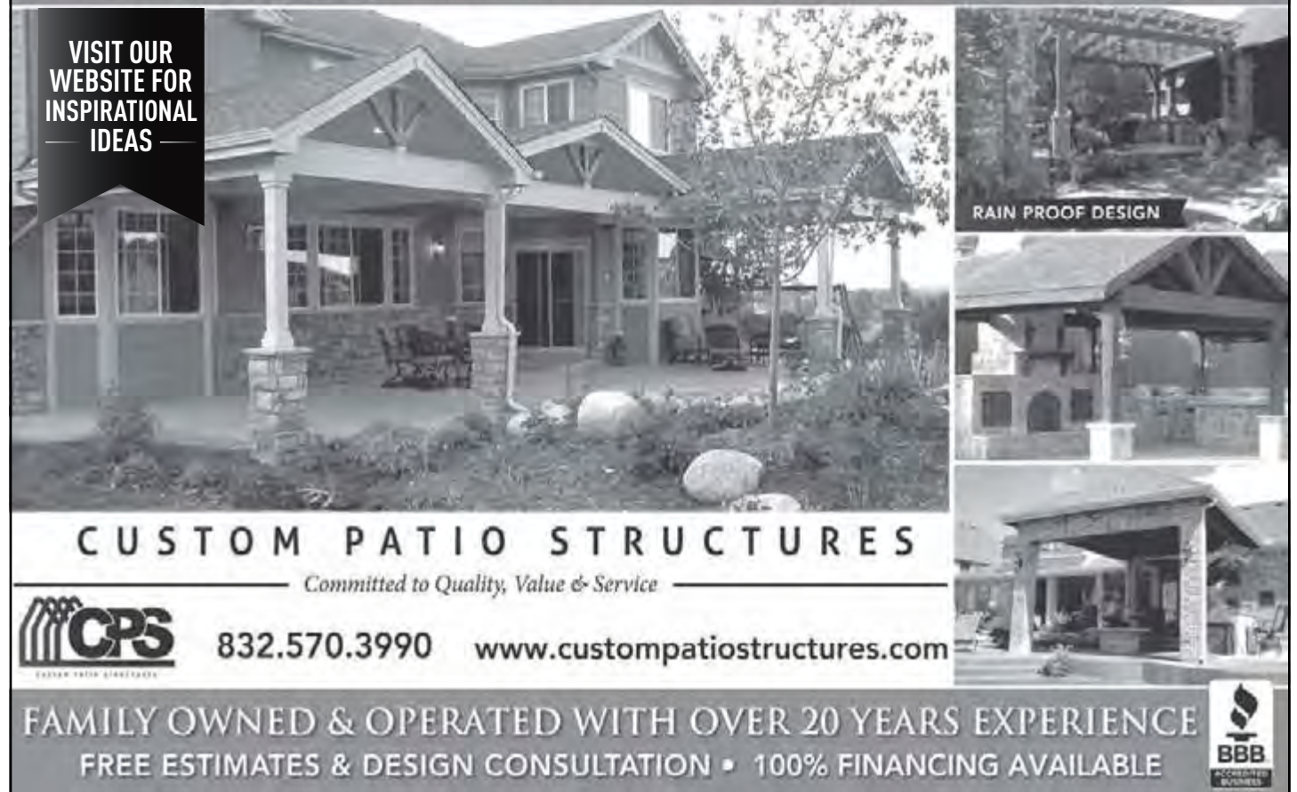
The Clippings - March 2017 11

PATIO COVERS | PERGOLAS | CARPORTS | PORTE COCHÈRES | OUTDOOR KITCHENS | DECORATIVE OUTDOOR FLOORING