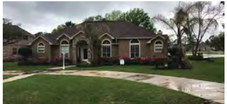
Roy and Connie Saunders @ 7806 Magnolia Cove Ct.