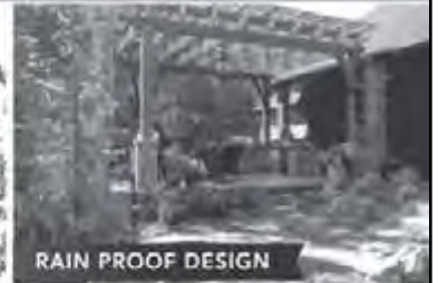
RAIN PROOF DESIGN