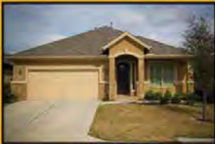
4309 Tambre Bend 3 Bed, 2 Bath, 2,045 SF $439,500