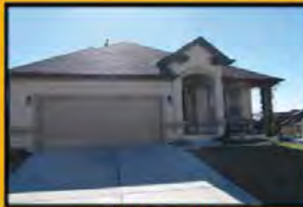
3821 Tordera Dr. 3 Bed, 2 Bath, 2,029 SF $449,500