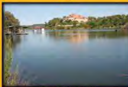
Barton Creek Lakeside 26201 Countryside Dr 1.1 Acre Deep Cove Waterfront Lot $299,000