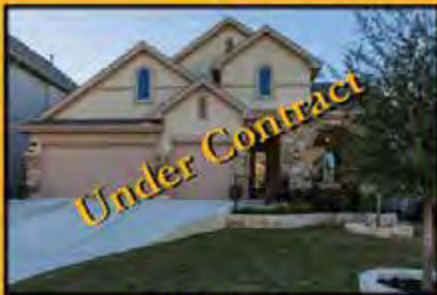
3716 Vinalopo Dr. 4 Bed, 3 Bath, 2,581 SF $559,900