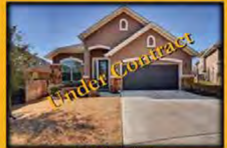
14324 Senia Bend 3 Bed, 2 Bath, 2,045 SF $429,000