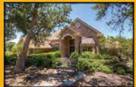
Barton Creek Lakeside 26014 Masters Pkwy 3 Bed, 3 Bath, 2,899 SF $599,000