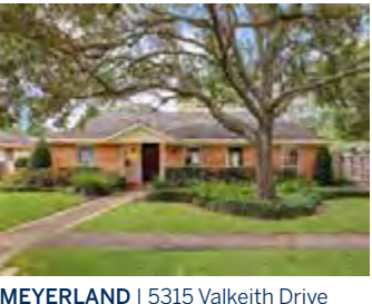
4 BEDROOMS | 3 BATHS Offered at $625,000