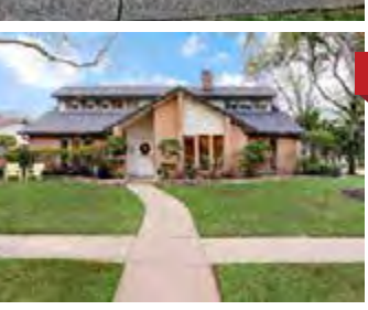
MEYERLAND | 5702 Jackwood Street MEYERLAND | 4971 Yarwell Drive 5 BEDROOMS | 3 BATHS Offered at $525,000