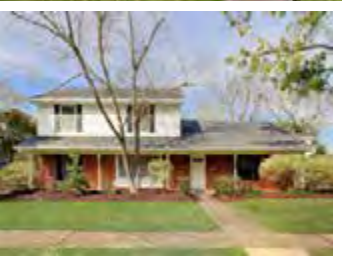
MEYERLAND | 5230 Caversham Drive MEYERLAND | 5315 Valkeith Drive 5-6 BEDROOMS | 3.5 BATHS Offered at $725,000