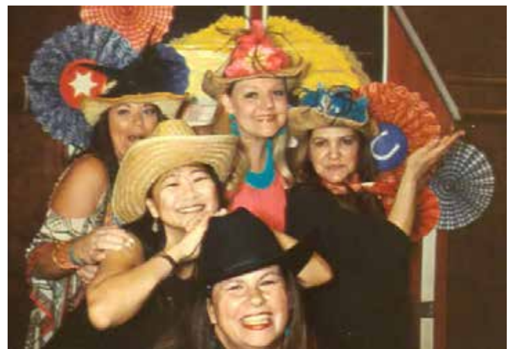
12 Meyerlander Monthly - April 2017