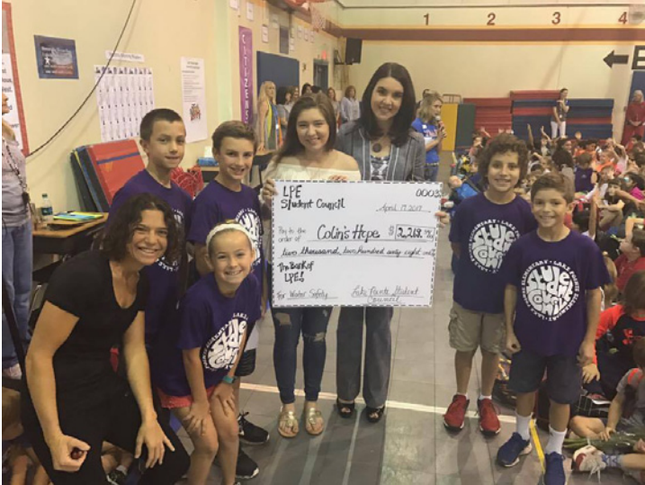
The Lake Pointe ES Student Council raised $2268.54 for Colin's Hope by hosting the 5th Annual Hope Floats Craft Fair.