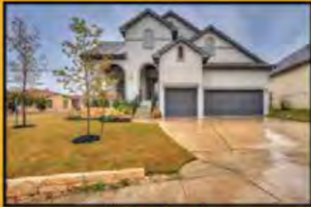
3705 Vinalopo Dr. 4 Bed, 3 Bath, 2,581 SF $489,900