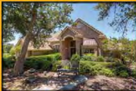
Barton Creek Lakeside 26014 Masters Pkwy 3 Bed, 3 Bath, 2,899 SF $575,000