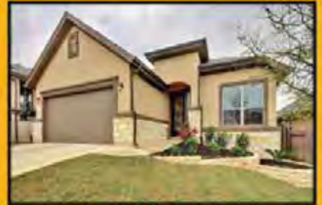
14409 Senia Bend 3 Bed, 2 Bath, 1,935 SF $420,000