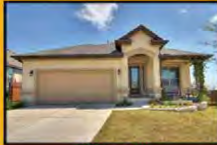
3821 Tordera Dr. 3 Bed, 2 Bath, 2,029 SF $439,500