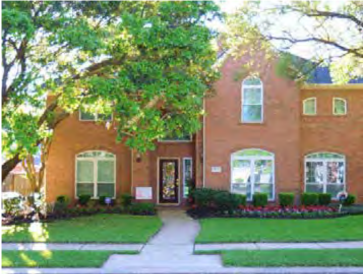
5523 Island Breeze

Congratulations to each one of you! Please allow 8 weeks to see the $25.00 credit added to your Cornelius Blooming Rewards account