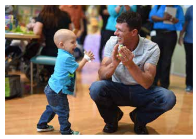
The father of a young cancer patient had the opportunity to spend quality time with his son in a controlled and fun environment, thanks to the KRS2 Eggstravaganza Spring Celebration.

To learn more about KidsRStrong2 and how you can support children with life-threatening illnesses, visit www.krs2.org.