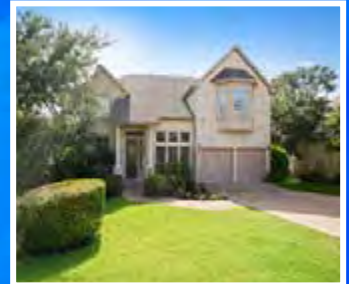
3900 MIRA VISTA $525,000