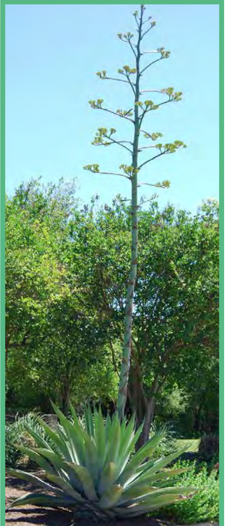
Blooming agave at the intersection of Quinlan Park Road & Steiner Ranch Boulevard