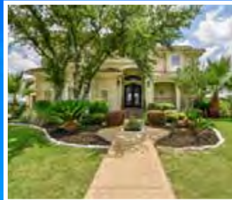
1609 LAKECLIFF HILLS $1,289,000