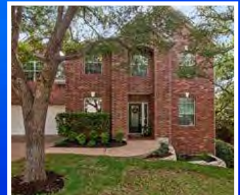
13013 TITUS CT. $449,000

For more information about these listings as well as others that are COMING SOON, visit www.SteinerRanchInfo.com