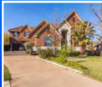
11604 PELICAN BAY COVE $799,000