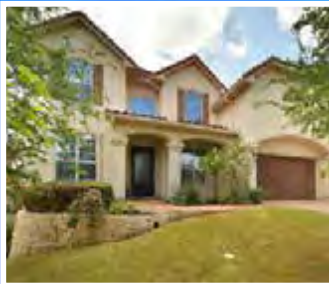
11601 WOODLAND HILLS TRAIL $625,000