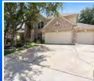
3217 SUMMER CANYON $550,000