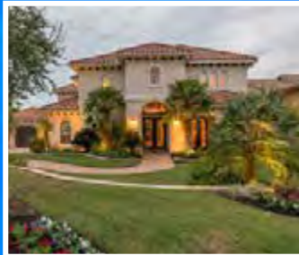
2108 UNIVERSITY CLUB $1,199,000