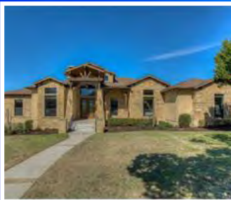
3316 SCENIC OVERLOOK $889,000