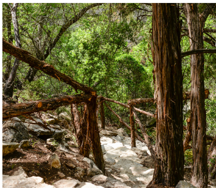
New trail improvements at the front of Sweetwater