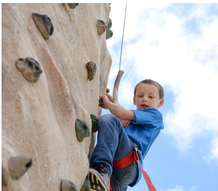
Enjoying the Rockwall at the Wild Flower Festival