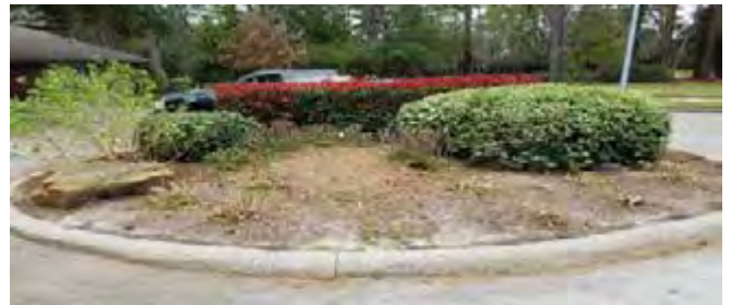
Melody Circle – February 17, 2017

Our Grounds Committee at work for Woodwind Lakes