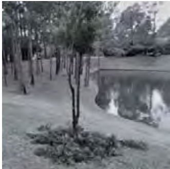
Lake #2 violation by Tot Lot Playground

If you observe a plant or tree that needs attention, please contact Sterling ASI.