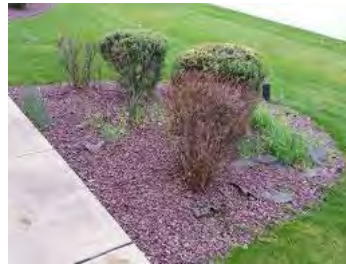
Please remove dead shrubs.

At our own homes we need to be doing the same. You may be subject to a fine when Sterling conducts their bi-monthly neighborhood inspections if there are dead or unpruned plants in your yard. Please avoid being fined by removing or pruning.