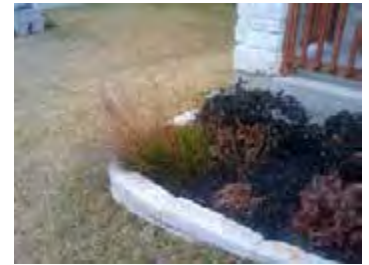
Please cut-off any dead areas of living plants.