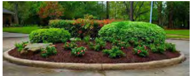
Melody Circle – March 10, 2017

Added an ornamental Blueberry tree, Drift Coral roses, Drift Pink roses, Bottlebrush ferns and Blue Porter bush.