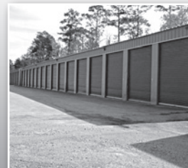
BOAT / RV STORAGE