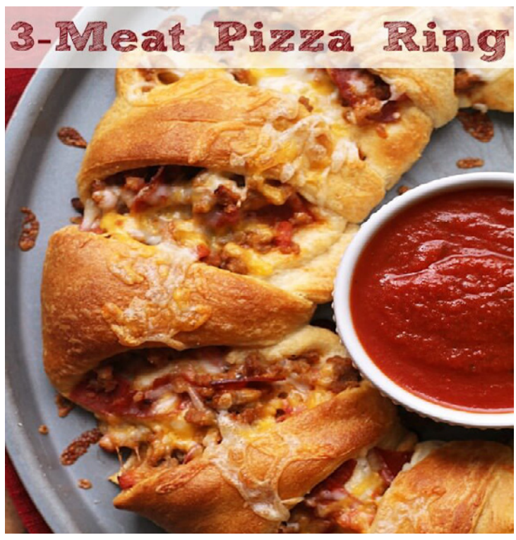
Preparation: 20 minutes Cook Time: 20 minutes Serves: 8