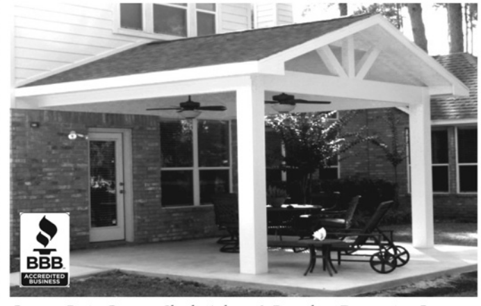
Custom Patio Covers . Shade Arbors & Pergolas . Decorative Concrete Patio Cover Screenrooms . Woodgrain Embossed Aluminum Covers

Atascocita Forest - June 2017 Copyright © 2017 Peel, Inc.