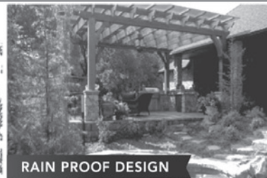
RAIN PROOF DESIGN