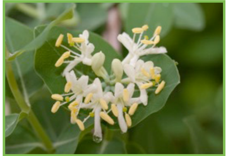
White Bush Honeysuckle

While there are many cultivated varieties of clematis available, the native ones include Scarlet Clematis ( Clematis texensis ) and Purple Leatherflower ( Clematis pitcheri ). A slightly woody vine growing to about 9 feet, Scarlet Clematis has thick, leather-like, red, bell-shaped flowers followed by a feathery ball of plumed seeds. It is very drought tolerant and is native only to the southeastern Edwards Plateau region. Purple Leatherflower is a climbing vine growing to 10 feet, with opposite leaves divided into