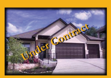
3709 Vinalopo Dr. 3 Bed, 2 Bath, 2,136 SF $449,900