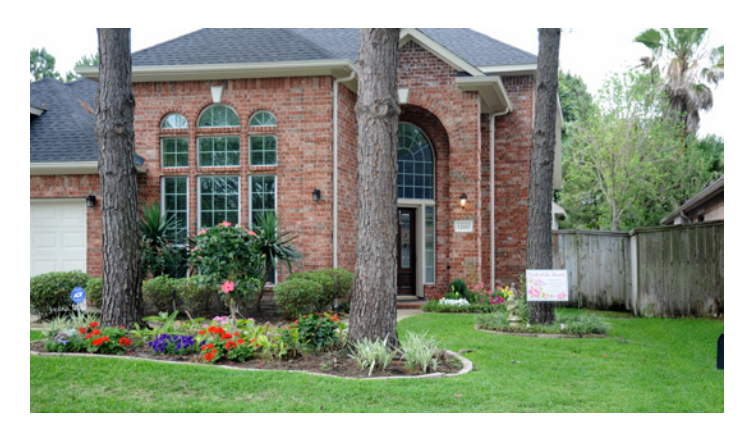
12110 Laguna Point Ln.

Congratulations to each one of you! Please allow 8 weeks to see the $25.00 credit added to your Cornelius Blooming Rewards account