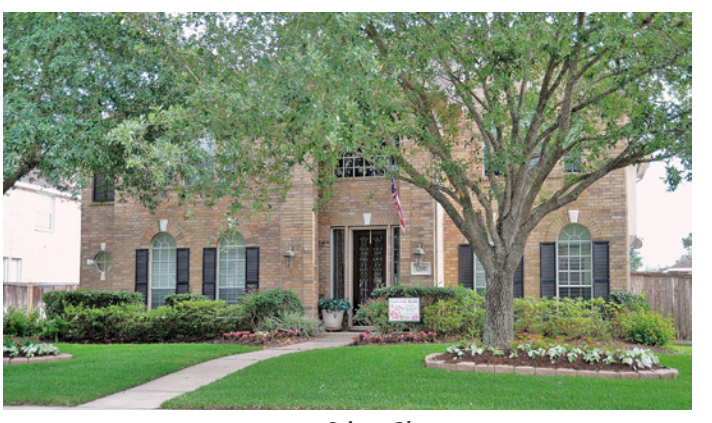
12911 Silent Shore