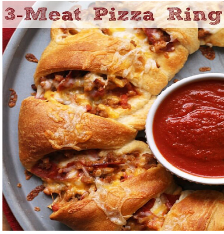
Preparation : 20 minutes Cook Time : 20 minutes Serves : 8