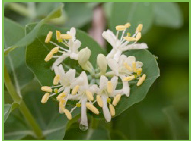
White Bush Honeysuckle

is a climbing vine growing to 10 feet, with opposite leaves divided into 3 to 5 pairs of leaflets, and nodding, urn-shaped, long-lasting purple flowers. Both of these native clematis species offer cover and