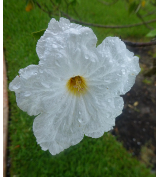
Photo: The Mexican Olive Tree produces blooms nearly year-round.

Water young trees weekly to assure the roots stay damp (not wet). Water older trees if there isn't any rain. Keep mulch around plants to retain moisture. Keep mulch away from trunks. You should see the "flare" at the bottom of the tree.