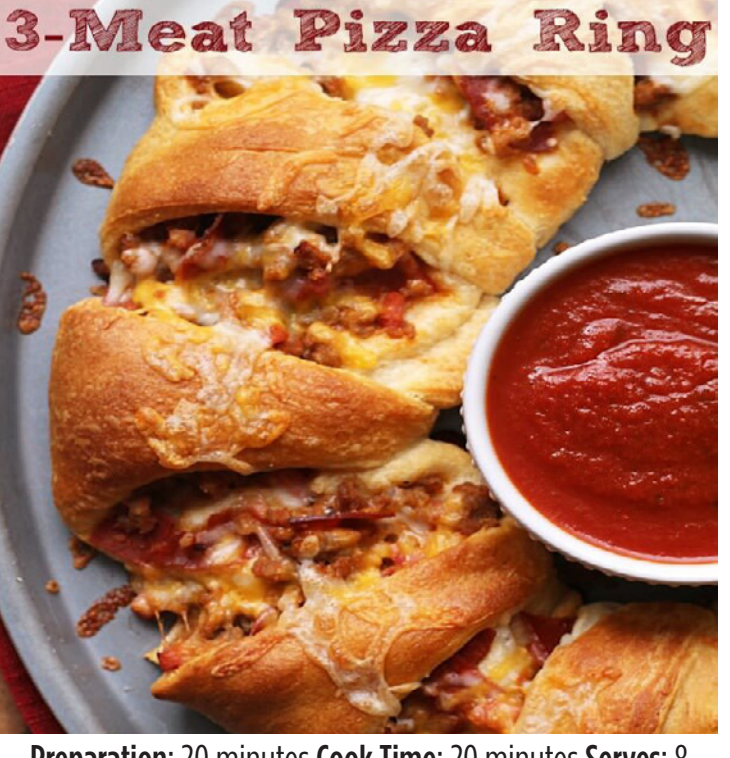
Preparation: 20 minutes Cook Time: 20 minutes Serves: 8