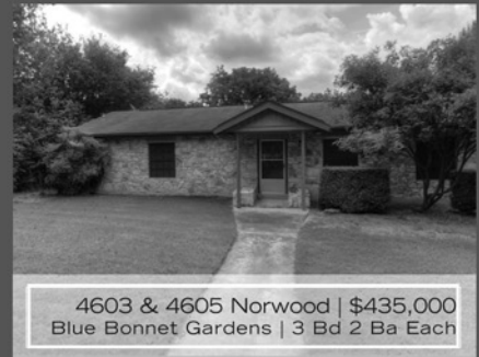
4603 & 4605 Norwood | $435,000 Blue Bonnet Gardens | 3 Bd 2 Ba Each