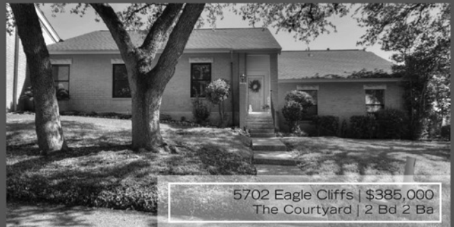
5702 Eagle Cliffs | $385,000 The Courtyard | 2 Bd 2 Ba