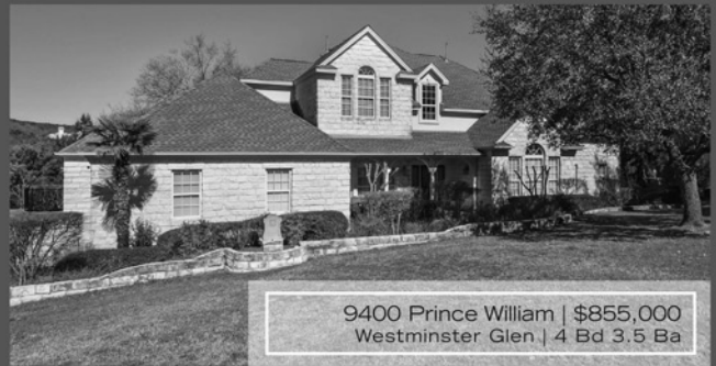
9400 Prince William | $855,000 Westminster Glen | 4 Bd 3.5 Ba