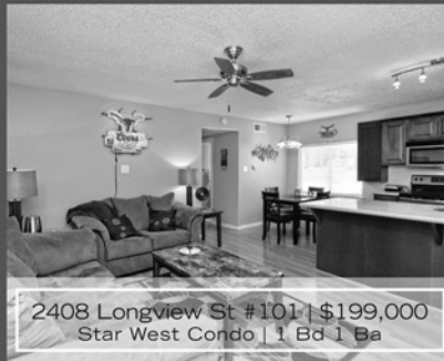
2408 Longview St #101 | $199,000 Star West Condo | 1 Bd 1 Ba