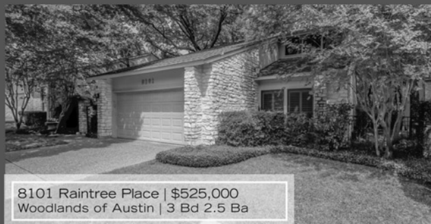
8101 Raintree Place | $525,000 Woodlands of Austin | 3 Bd 2.5 Ba