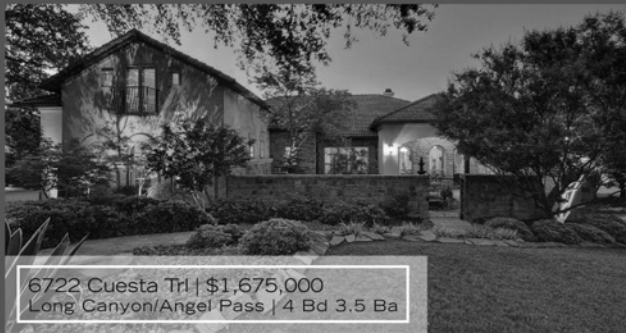
6722 Cuesta Trl | $1,675,000 Long Canyon/Angel Pass | 4 Bd 3.5 Ba