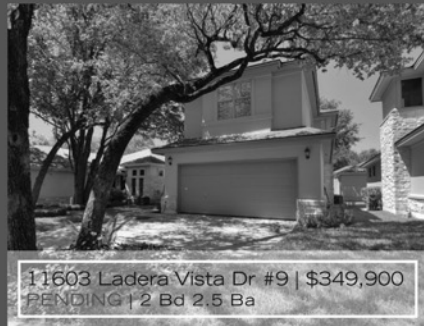
11603 Ladera Vista Dr #9 | $349,900 PENDING | 2 Bd 2.5 Ba