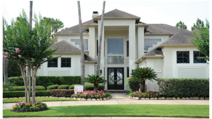
12522 Still Harbor Drive