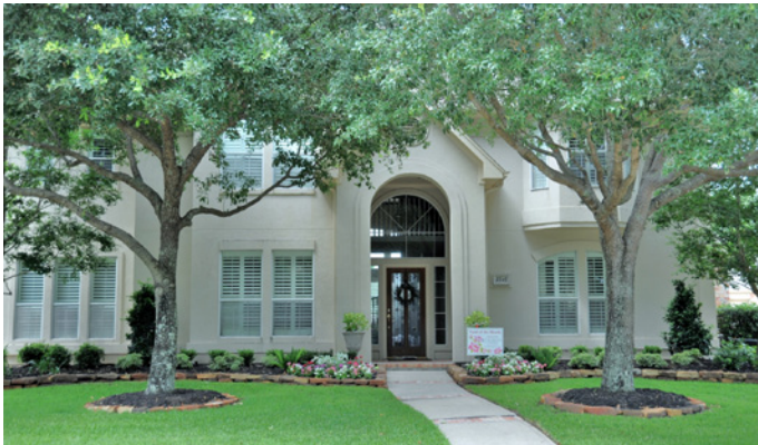
5414 Indian Shores Lane