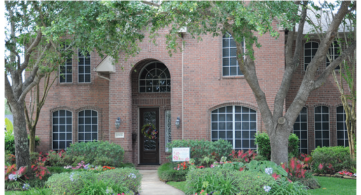
12126 Mill Stream Way

Please allow 8 weeks to see the $25.00 credit added to your Cornelius Blooming Rewards account