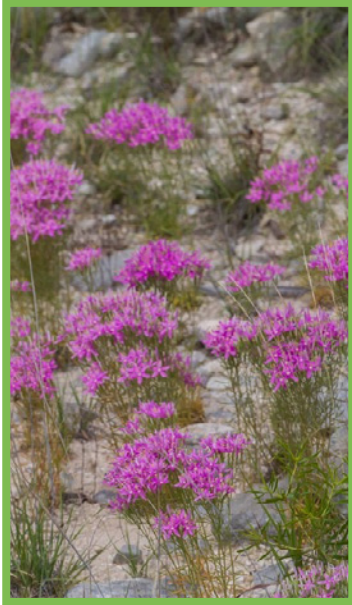
Mountain Pink Bouquets

As members of the Gentian Family, there are many species of Centaurium worldwide, and three of them are native right here in Central Texas. The genus was named after the centaur Chiron, famed in Greek mythology for being a great healer through his skill in using medicinal herbs. Herbalists today still use the extract from certain species in this genus, commercially often called 'stomach bitter', to aid in the process of digestion. More recently, molecular studies have reclassified the genus, and the species that belong to the 'Texas group' have been renamed Zeltnera .