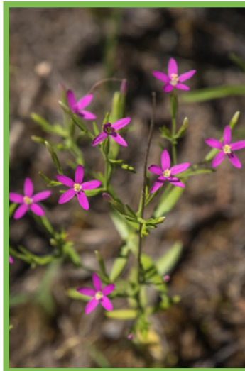
Lady Bird's Centaury

areas in otherwise dry habitat, along streams, on hillsides, and in prairies and meadows with intermittent drainages. An erect, branching plant up to 18 inches tall, it has larger, oblong leaves at the base and smaller linear leaves on the uppermost stems. Blooming May to July, the rose-pink five-petaled flowers are 0.5 to 1.5 inches wide, occur in an open array along the stalks, and have distinct, spirally curved, yellow pollen-producing anthers. Of all three species in our area, this one is a bit less common.