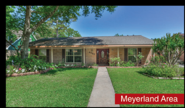
Beautifully Updated 3/2. Generous Backyard Space Julie Fischer $395,000