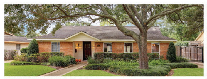
MEYERLAND | 5315 Valkeith Drive

4 BEDROOMS | 3 BATHS | OFFERED AT $599,000 | NEVER FLOODED Remodeled kitchen with Wolf gas oven/range and luxurious master bath.