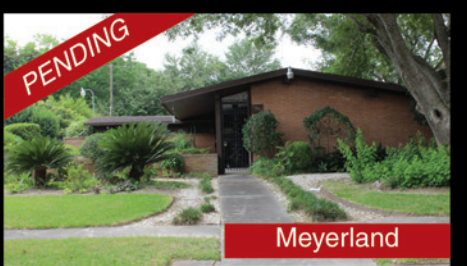
Large 10,900+ sqft. lot for you to build your Dream Home Bob Reader