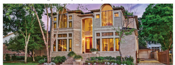
MEYERLAND | 4947 Heatherglen Drive

4 BEDROOMS | 3.5 BATHS | OFFERED AT $399,500 Amazing 16,988 square foot lot, zoned to award winning schools