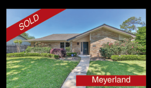
Renovated 4/2 with Neutral Colors and Architectural Interest Cindy Cook