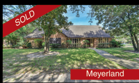
Over 4,600 sqft 6/4.5 Approved for Elevation Grant Marie Caplan