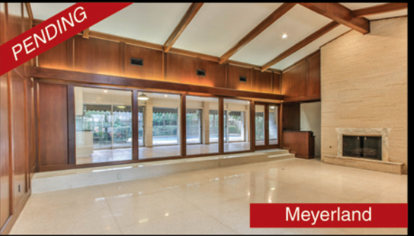
Stunning Mid-century Modern 5/5 Fully Remediated, Sparkling Pool Cindy Cook