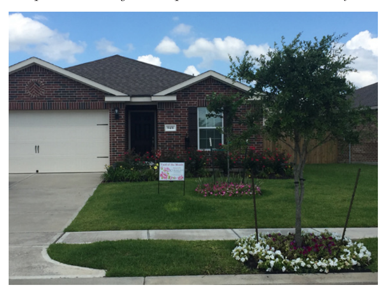
9431 Emerald Green Drive (section 12)

Special thanks for our sponswor Cornelius Nursery!