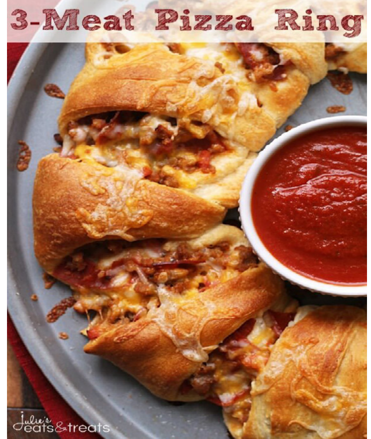
Preparation: 20 minutes Cook Time: 20 minutes Serves: 8