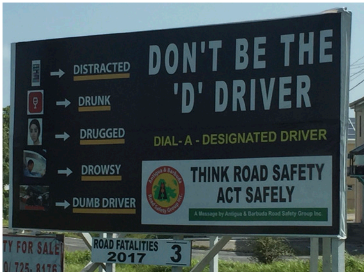
A Road Sign in Antigua

2. Check or replace the a/c filters. If the filters are expensive, pleated type, look at them through a bright light. If you can easily see the light, the filter may last a bit longer. If in doubt, replace it.