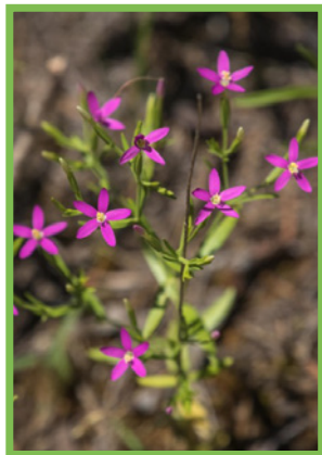
Lady Bird's Centaury

occur in an open array along the stalks, and have distinct, spirally curved, yellow pollen-producing anthers. Of all three species in our area, this one is a bit less common.