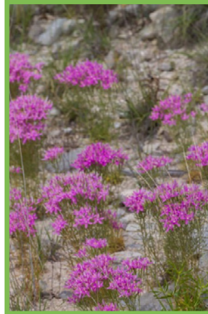
Mountain Pink Bouquets

Mountain Pink ( Zeltnera beyrichii ), also called Meadow Pink, Catchfly, or Quinine weed, is an annual herb less than a foot tall and best described as a neat bouquet of small, pink flowers. Blooming May through July, Mountain Pink sprouts up like an