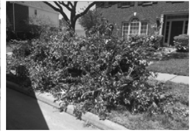
Unacceptable placement of branches: branches are not tied and bundled, are in a pile larger than 3' x 3' x 3', and are not neatly stacked with base of branches facing the street.