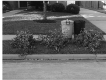
Acceptable placement of branches: individual piles that crews can wrap their arms around to load easily.

base of the branches facing the street. Although branches are not required to be tied and bundled, it is strongly encouraged. Branches must be no thicker than 4" in diameter to avoid damaging our equipment. Limit 8 bundles/piles per service day.