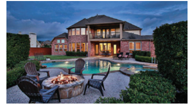
21306 Fairhaven Creek | $699,999 5 bedrooms / 4 full, 2 half baths / 3 car garage