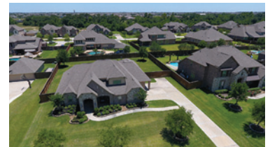
21407 Harbor Water | $550,000 | 4/3 full, 2 half / 3 Pended in 1 DAY!

©2017 Better Homes and Gardens Real Estate LLC. Better Homes and Gardens® is a registered trademark of Meredith Corporation licensed to Better Homes and Gardens Real Estate LLC. Equal Opportunity Company. Equal Housing Opportunity. Each Franchise is Independently Owned and Operated.