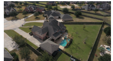
21010 Pricewood Manor Court | $599,750 4 bedrooms / 3 full, 2 half baths / 5 car garage