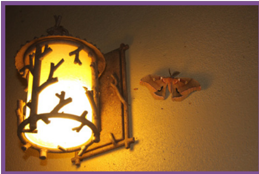
Polyphemus Silk Moth

Lepidoptera is the order of insects that includes both butterflies and moths. While over 180,000 species of these insects have been identified worldwide, recent estimates suggest that this order may have more species than previously thought, and is among the four most speciose orders, along with Hymenoptera (sawflies, wasps, bees, & ants), Diptera (true flies, mosquitoes, gnats, & midges), and Coleoptera (beetles). Of the approximately 180,000 known Lepidoptera species, some 160,000 are moths, with nearly 11,000 of them found in the United States, and many are yet to be described.