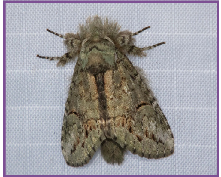
Small Heterocampa Moth

source is by becoming stationary itself, effectively being 'trapped' by the light rather than 'attracted' to it. Those interested in studying moths have taken advantage of this fact, and have developed a method called blacklighting to attract and photograph moths. The first step is to set up a light source, and either an ultraviolet light (also known as a blacklight) or a mercury vapor light can be used. Mercury vapor is now the preferred source, as it provides a different spectrum of light than a blacklight, although a blacklight emits a broader spectrum of light. Moths can see waves of light that humans cannot, so providing them with different spectrums will generally produce the greatest response. The light is carefully hung or positioned in front a vertical white sheet, which the light bounces off to produce a big, concentrated, glowing mass, while providing a safe surface for the moths to land.