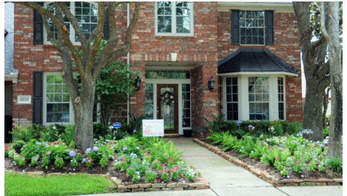
12522 Still Harbor Drive