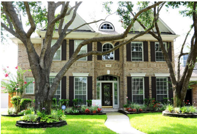
5506 Chase Harbor