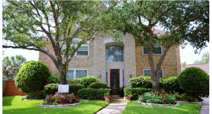
12107 Auburn Shores Court

Congratulations to each one of you! Please allow 8 weeks to see the $25.00 credit added to your Cornelius Blooming Rewards account