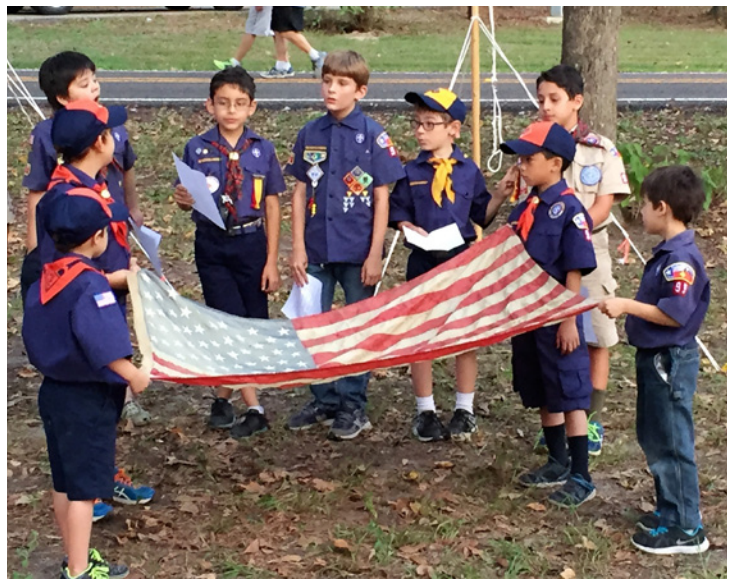
St. Thomas More's Pack 99 conducting a flag ceremony during a fall camping trip.