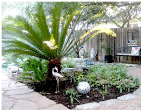
Palms, pathways and sculptures make a stroll in this garden delightful