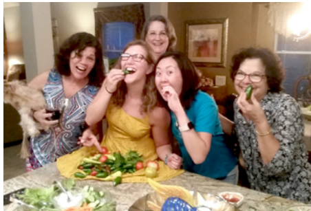
Peppers from Will's Garden