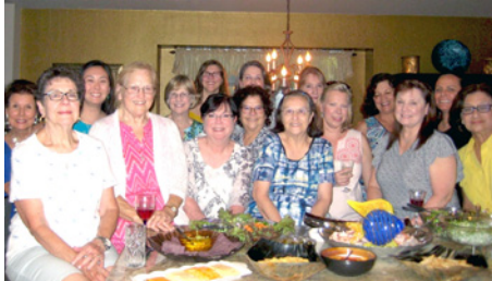
Garden Club members share a delicious meal

Sendera Garden Club meets on the third Thursday of each month. If you would like to join us, please call me at 512-940-8430 to find out when and where our next meeting will be held.