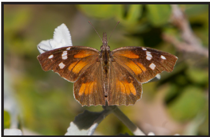
American Snout Butterfly

The change from late summer into early fall can trigger some unusual natural events, and at this time of year in Central Texas, we can often see periodic population explosions of the American Snout butterfly.