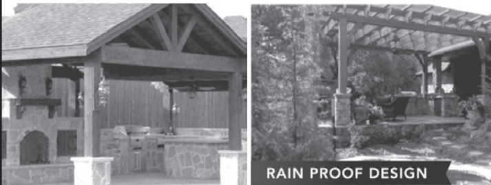
RAIN PROOF DESIGN