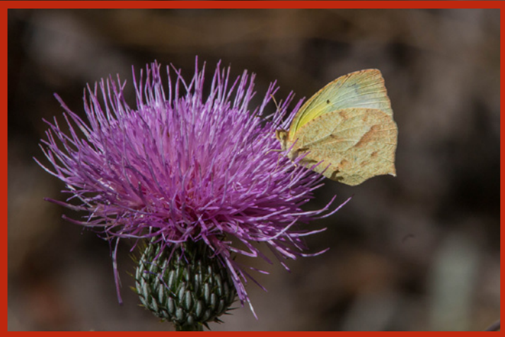
A Mexican Yellow butterfly nectaring on a Texas Thistle.

As one of the most wrongly maligned and misunderstood group of wildflowers, native thistles have never been truly embraced, not even by wildscape gardeners or habitat restoration practitioners. While these plants play a significant role in our ecosystems, they have been a direct casualty of habitat loss, first by plow-based agriculture and followed by the continual development of roads and cities. Further, recent invasions of non-native, exotic thistle species and the inability to discern them from the superficially similar native species, have contributed to their unjustified reputation and ongoing demise.