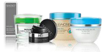
Facial & Body Set