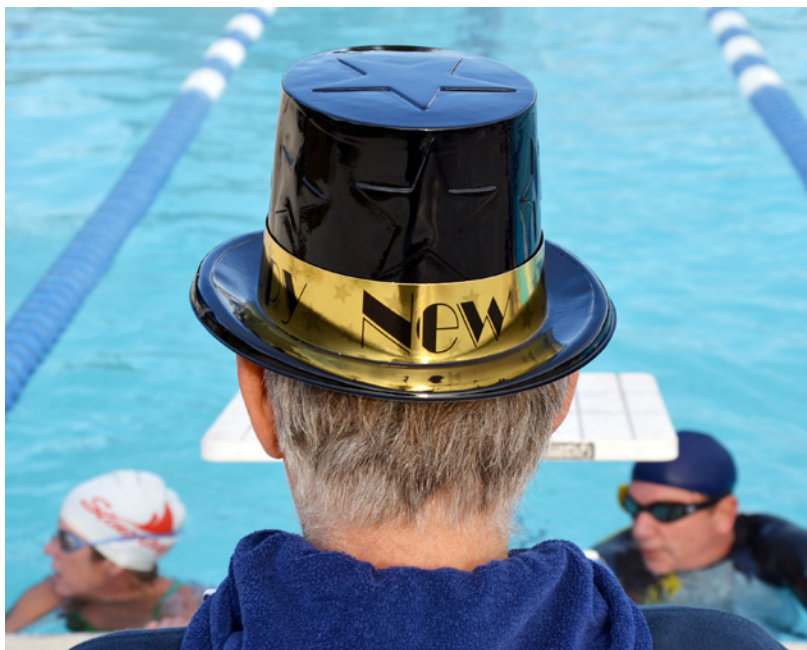
Lakeway Swim Center welcomes swimmers to take on their resolutions at the New Year's Swim Challenge on Dec. 29.

Cost is free for Swim Center members and $5 per non-member. Swimmers also may order event T-shirts for $15 each through Dec. 13. For information, visit the website or call 512-261-3000.