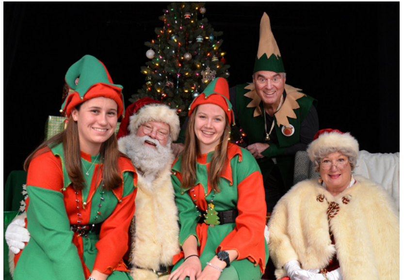
Santa and Mrs. Claus will visit with children at Breakfast with Santa on Dec. 9 at Lakeway Activity Center. Two seatings are scheduled for 8:30 a.m. and 10:30 a.m.

Space is limited, and tickets are mandatory. Please arrange to pick up tickets before the day of the event. For information, call 512-261-1010.