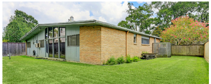
MEYERLAND | 4918 Yarwell Drive 4 BEDROOMS | 2 BATHS | 9,243 SQ. FT. LOT | OFFERED AT $288,000