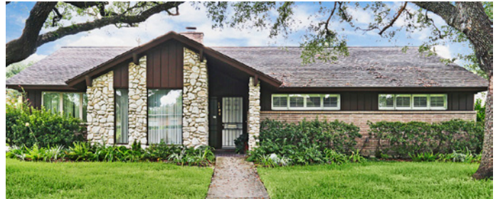
MEYERLAND | 5106 Cheena Drive 4 BEDROOMS | 2 BATHS | 9,718 SQ. FT. LOT | OFFERED AT $299,900