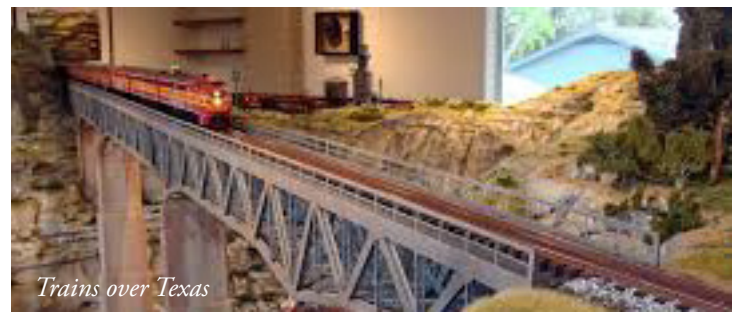
Trains over Texas