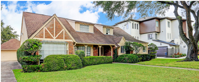
MEYERLAND | 5014 Glenmeadow 5 BEDROOMS | 3.5 BATHS | 10,920 SQ. FT. LOT | OFFERED AT $348,500