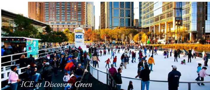
ICE at Discovery Green