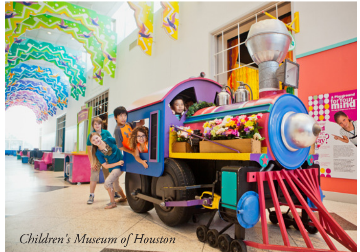
Children's Museum of Houston