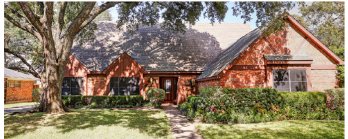
MEYERLAND | 4922 Imogene Street 4-5 BEDROOMS | 3 BATHS | 10,152 SQ. FT. LOT | OFFERED AT $345,000

Contact us with all your real estate needs.