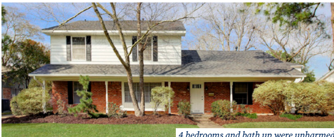
MEYERLAND | 5230 Caversham Drive 5-6 BEDROOMS | 3.5 BATHS | 11,445 SQ. FT. LOT | OFFERED AT $499,000 4 bedrooms and bath up were unharmed