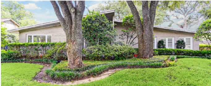
MEYERLAND | 4823 Braesvalley Drive 3 BEDROOMS | 2 BATHS | 13,622 SQ. FT. LOT | OFFERED AT $385,000