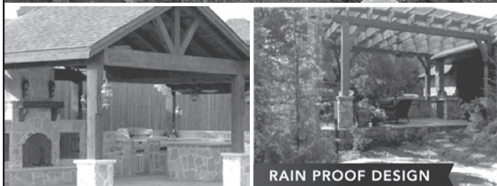
RAIN PROOF DESIGN