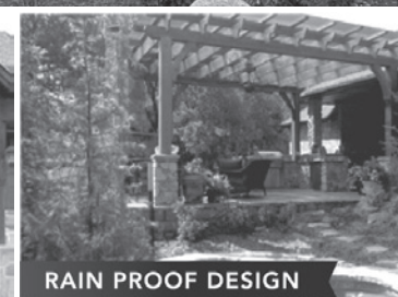
RAIN PROOF DESIGN