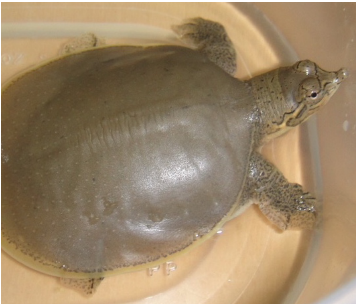
The photo is of a soft shell turtle admitted to TWRC for care.

Some lump anything with an outside shell into the turtle category when in fact there are distinct differences between turtles and tortoises. Both are reptiles but turtles live in the water and the tortoise is a land-dweller.