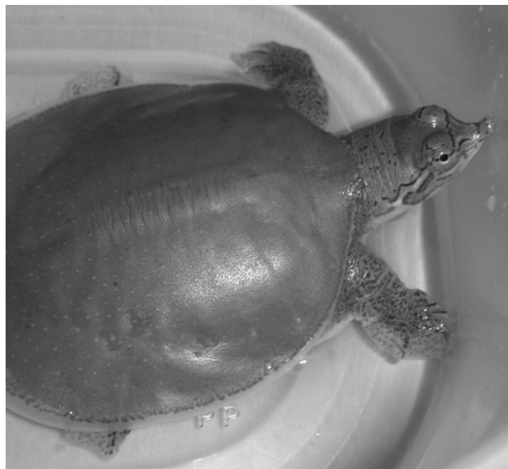
The photo is of a soft shell turtle admitted to TWRC for care.

TWRC Wildlife Center is a 38-year-old non-profit organization that is your resource for wildlife questions and concerns. Check out our website at www.twrcwildlifecenter.org or give us a call at 713-468-TWRC.