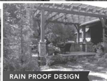
RAIN PROOF DESIGN