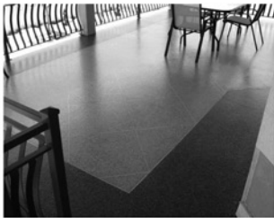
Make Your Patio More Relaxing!