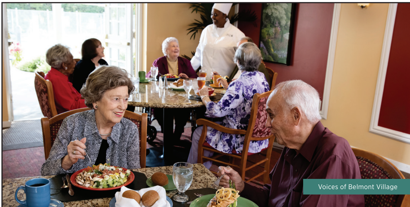
Voices of Belmont Village

"We haven't missed our house or car since we got here!"