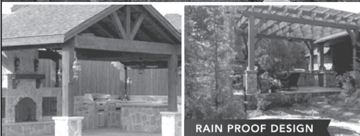
RAIN PROOF DESIGN